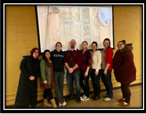
O'PLAINE CAMPUS ENGLISH DEPARTMENT STAFF VOLUNTEER AT FEED MY STARVING CHILDREN FOOD PANTRY.

Warren staff and students volunteered time at Feed My Starving Children in Libertyville, Illinois.