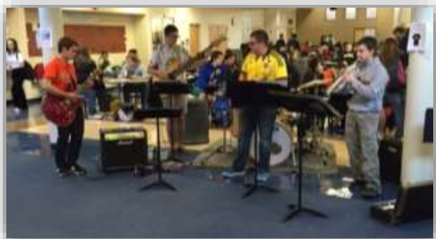
ALMOND JAZZ STUDENTS PERFORM IN THE FOYER DURING KINDNESS WEEK

The ILMEA hosts nine different district festivals in the fall. More than 100 high schools participate in ILMEA in District 7, which includes Lake County, Northern Cook County and Eastern McHenry County. Auditions were held in early October and the top students on each instrument and voice part were selected to perform with the District 7 Choir and Band in November. After the District Festivals in November, the top students from each of the nine ILMEA Districts are selected to the ILMEA All-State Festival in January. Being selected to the ILMEA State Festival is the highest individual honor a high school musician can receive.